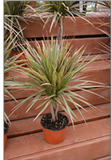
Colorama Dracaena in full

When grown indoors, Colorama Dracaena can be expected to grow to be about 3 feet tall at maturity, with a spread of 24 inches. It grows at a medium rate, and under ideal conditions can be expected to live for approximately 10 years. This houseplant performs well in both bright or indirect sunlight and strong artificial light, and can therefore be situated in almost any well-lit room or location. It does best in average to evenly moist soil, but will not tolerate standing water. The surface of the soil shouldn't be allowed to dry out completely, and so you should expect to water this plant once and possibly even twice each week. Be aware that your particular watering schedule may vary depending on its location in the room, the pot size, plant size and other conditions; if in doubt, ask one of our experts in the store for advice. It is not particular as to soil type or pH; an average potting soil should work just fine.