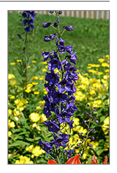
Pacific Giant Black Knight Larkspur flowers