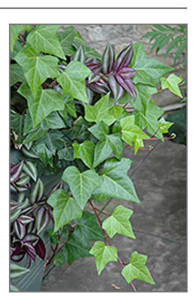
Algerian Ivy foliage

There are many factors that will affect the ultimate height, spread and overall performance of a plant when grown indoors; among them, the size of the pot it's growing in, the amount of light it receives, watering frequency, the pruning regimen and repotting schedule. Use the information described here as a guideline only; individual performance can and will vary. Please contact the store to speak with one of our experts if you are interested in further details concerning recommendations on pot size, watering, pruning, repotting, etc.