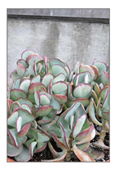
Silver Dollar Plant