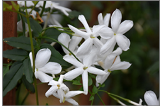
Climbing Jasmine flowers

This is a dense multi-stemmed evergreen houseplant with a spreading, ground-hugging habit of growth. This plant may benefit from an occasional pruning to look its best.