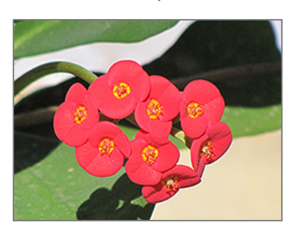
Hybrid Crown Of Thorns flowers