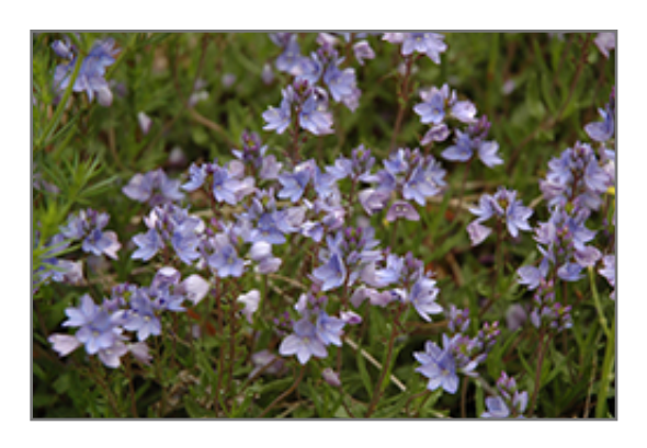
Blue Carpet Speedwell flowers