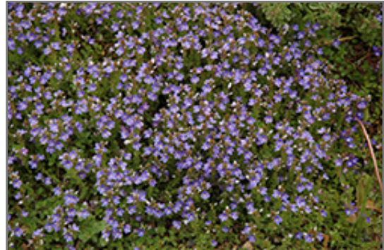
Turkish Speedwell in bloom

Turkish Speedwell is recommended for the following landscape applications;