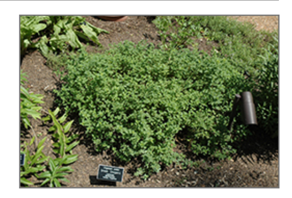
Greek Oregano

Greek Oregano will grow to be about 16 inches tall at maturity extending to 24 inches tall with the flowers, with a spread of 14 inches. When grown in masses or used as a bedding plant, individual plants should be spaced approximately 12 inches apart. Its foliage tends to remain dense right to the ground, not requiring facer plants in front. Although it's not a true annual, this fast-growing plant can be expected to behave as an annual in our climate if left outdoors over the winter, usually needing replacement the following year. As such, gardeners should take into consideration that it will perform differently than it would in its native habitat.