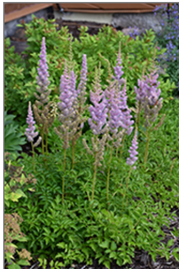
Dwarf Chinese Astilbe in bloom