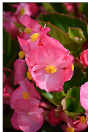
Big Pink Green Leaf Begonia flowers