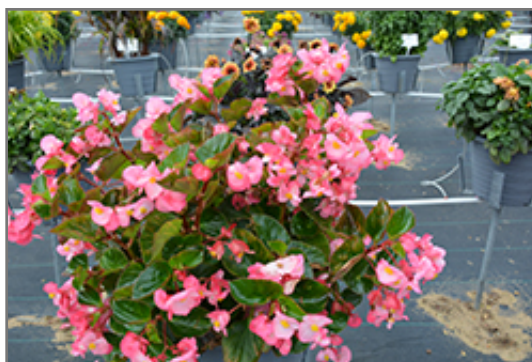
Big Pink Green Leaf Begonia in bloom

Big Pink Green Leaf Begonia is a fine choice for the garden, but it is also a good selection for planting in outdoor containers and hanging baskets. It is often used as a 'filler' in the 'spiller-thriller-filler' container combination, providing a mass of flowers and foliage against which the larger thriller plants stand out. Note that when growing plants in outdoor containers and baskets, they may require more frequent waterings than they would in the yard or garden.