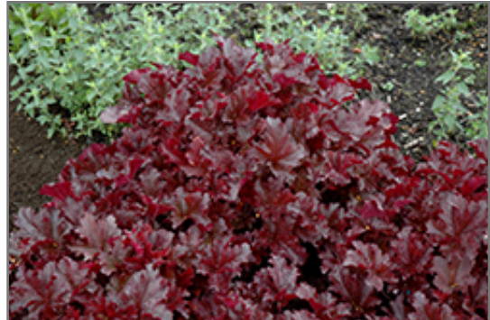
Midnight Ruffles Coral Bells

Midnight Ruffles Coral Bells is recommended for the following landscape applications;