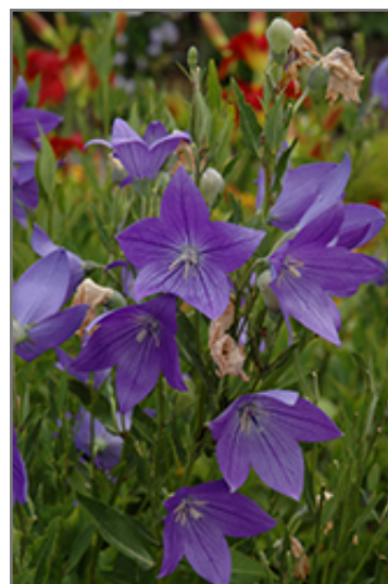
Fuji Blue Balloon Flower flowers