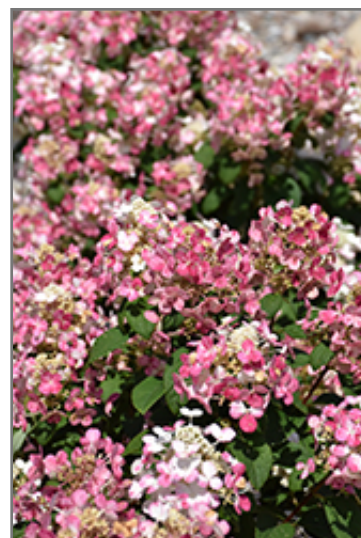
Little Quick Fire Hydrangea flowers