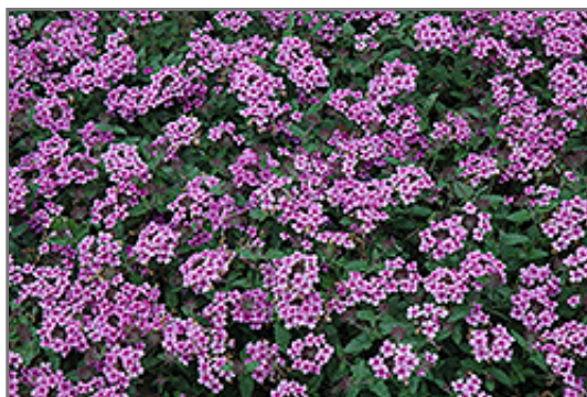
EnduraScape Lavender Verbena in bloom