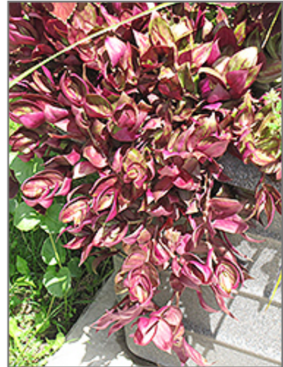
Purple Wandering Jew