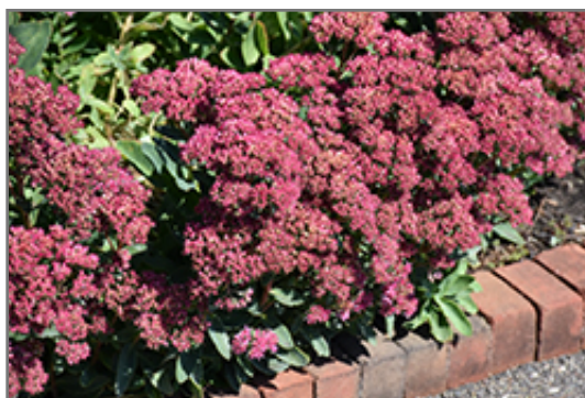
Carl Stonecrop in bloom

Carl Stonecrop is recommended for the following landscape applications;