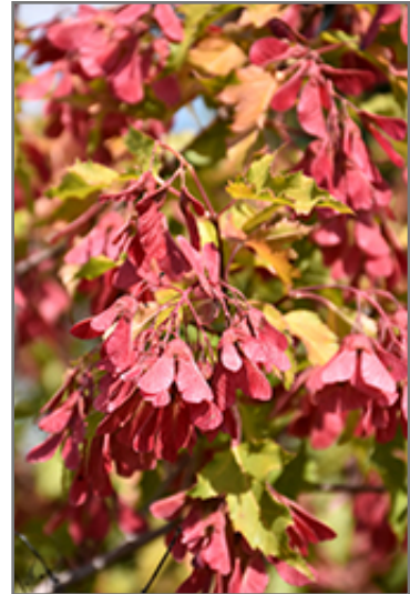
Amur Maple (tree form) fruit

This tree does best in full sun to partial shade. It is very adaptable to both dry and moist locations, and should do just fine under average home landscape conditions. It is not particular as to soil type or pH. It is highly tolerant of urban pollution and will even thrive in inner city environments. This is a selected variety of a species not originally from North America.