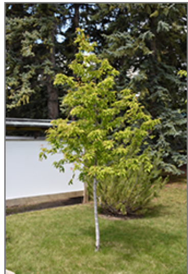
Amur Maple (tree form)