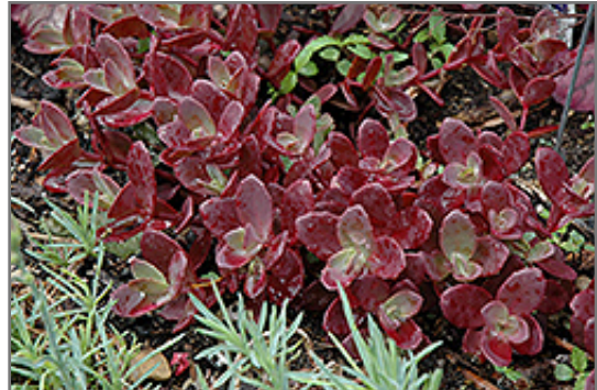
Firecracker Stonecrop foliage

Firecracker Stonecrop is recommended for the following landscape applications;