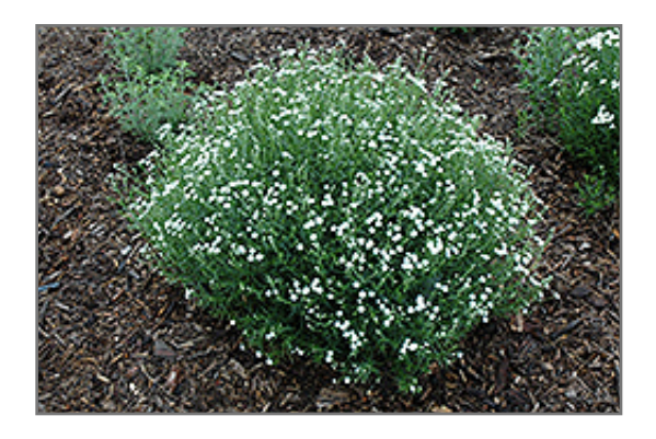
Ballerina Sneezewort in bloom