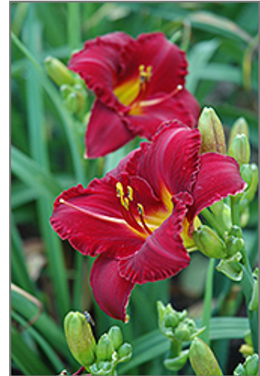
Pygmy Prince Daylily flowers