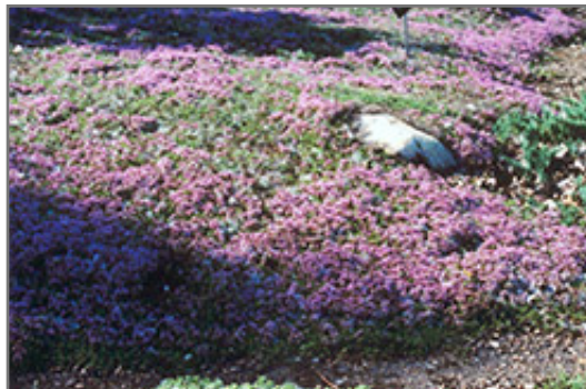
Mother-of-Thyme in bloom