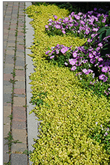
Golden Creeping Jenny