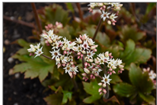
Karasuba Mukdenia flowers