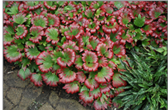
Karasuba Mukdenia

Karasuba Mukdenia is recommended for the following landscape applications;