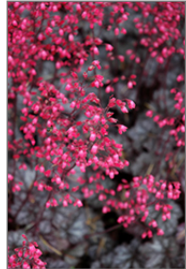
Glitter Coral Bells flowers

Glitter Coral Bells will grow to be about 10 inches tall at maturity extending to 16 inches tall with the flowers, with a spread of 14 inches. When grown in masses or used as a bedding plant, individual plants should be spaced approximately 12 inches apart. Its foliage tends to remain low and dense right to the ground. It grows at a medium rate, and under ideal conditions can be expected to live for approximately 10 years. As an evergreen perennial, this plant will typically keep its form and foliage year-round.