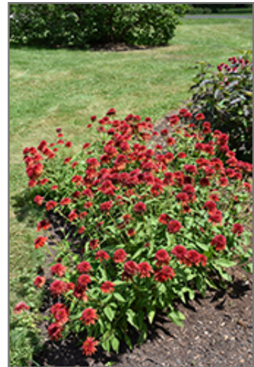
Double Scoop Orangeberry Coneflower in bloom