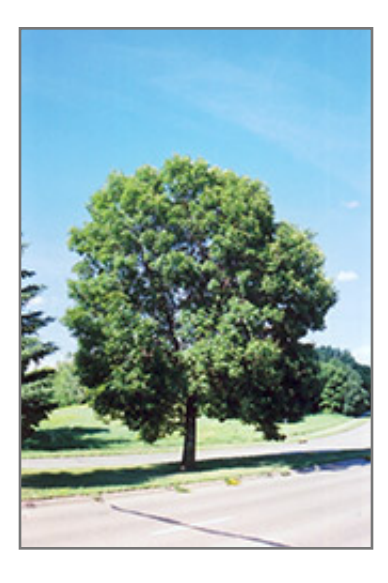
Green Ash