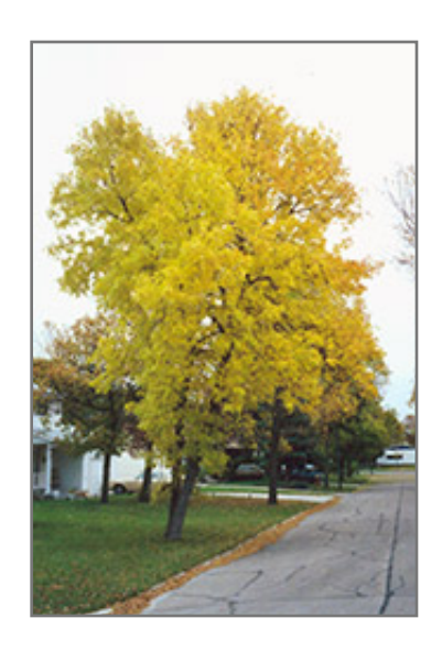
Green Ash in fall