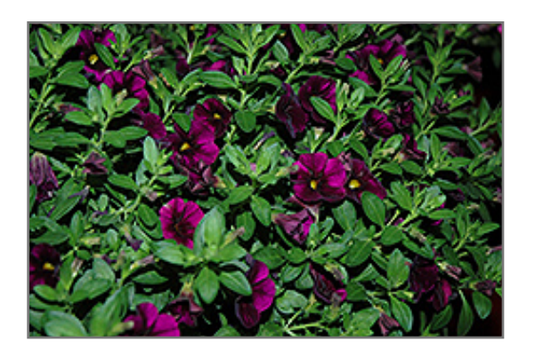
Aloha Kona Midnight Purple Calibrachoa flowers