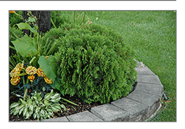
Danica Arborvitae