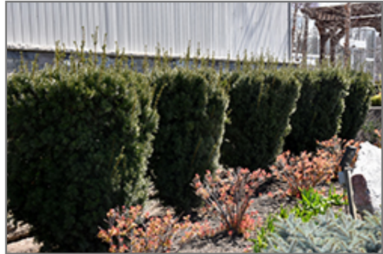
Hicks Yew

This shrub performs well in both full sun and full shade. However, you may want to keep it away from hot, dry locations that receive direct afternoon sun or which get reflected sunlight, such as against the south side of a white wall. It does best in average to evenly moist conditions, but will not tolerate standing water. It is not particular as to soil type or pH. It is highly tolerant of urban pollution and will even thrive in inner city environments, and will benefit from being planted in a relatively sheltered location. Consider applying a thick mulch around the root zone in winter to protect it in exposed locations or colder microclimates. This particular variety is an interspecific hybrid, and parts of it are known to be toxic to humans and animals, so care should be exercised in planting it around children and pets.