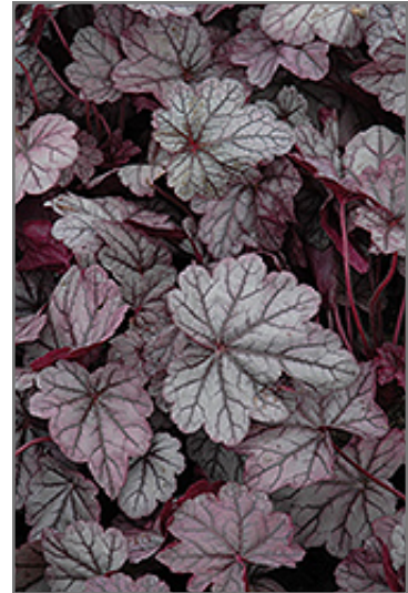
Carnival Sugar Plum Coral Bells foliage

Carnival Sugar Plum Coral Bells is recommended for the following landscape applications;