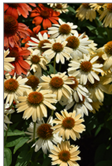
Sombrero Sandy Yellow Coneflower flowers