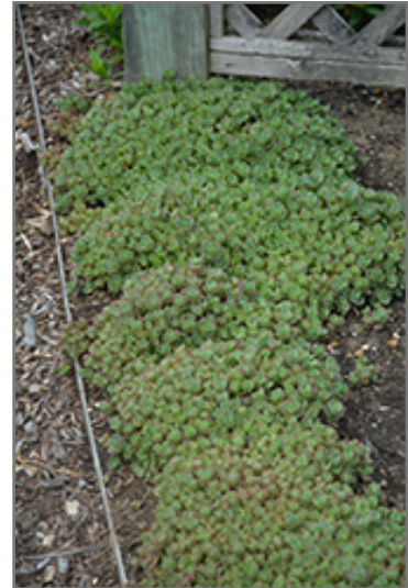
Lime Zinger Stonecrop

Lime Zinger Stonecrop is a fine choice for the garden, but it is also a good selection for planting in outdoor pots and containers. Because of its spreading habit of growth, it is ideally suited for use as a 'spiller' in the 'spiller-thriller-filler' container combination; plant it near the edges where it can spill gracefully over the pot. Note that when growing plants in outdoor containers and baskets, they may require more frequent waterings than they would in the yard or garden. Be aware that in our climate, most plants cannot be expected to survive the winter if left in containers outdoors, and this plant is no exception. Contact our experts for more information on how to protect it over the winter months.