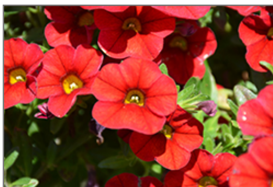
Superbells Red Calibrachoa flowers