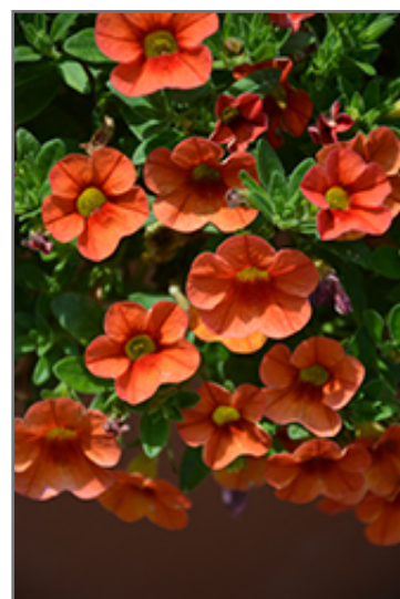
Aloha Hot Orange Calibrachoa flowers