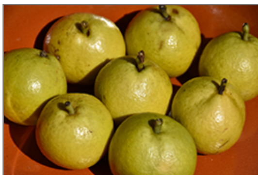
Golden Spice Pear fruit

Golden Spice Pear is smothered in stunning clusters of white flowers with purple anthers along the branches in mid spring. It has dark green deciduous foliage. The glossy oval leaves turn an outstanding burgundy in the fall. The fruits are showy yellow pears with a red blush and which fade to gold over time, which are carried in abundance from late summer to early fall. The fruit can be messy if allowed to drop on the lawn or walkways, and may require occasional clean-up.