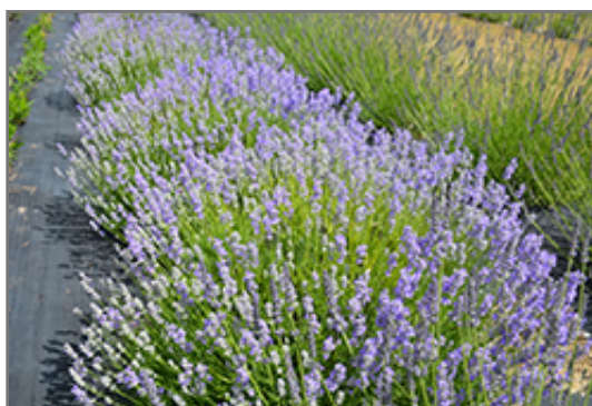
Blue Cushion Lavender in bloom