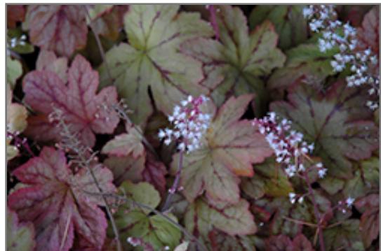
Redstone Falls Foamy Bells flowers