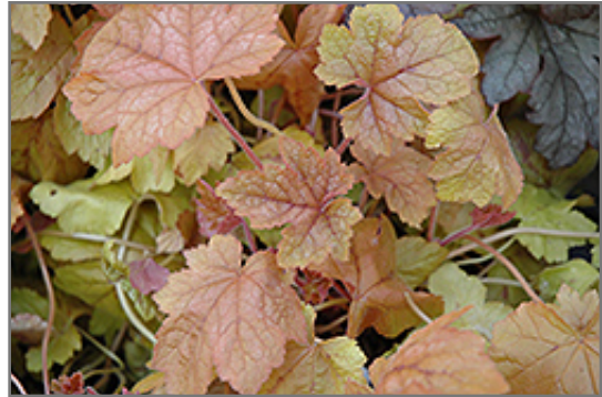
Redstone Falls Foamy Bells foliage

Redstone Falls Foamy Bells is recommended for the following landscape applications;