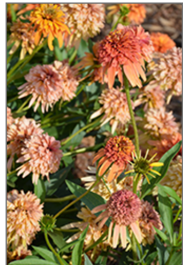
Cone-fections Marmalade Coneflower flowers