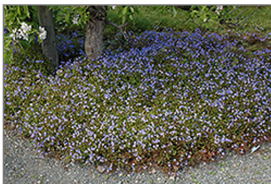
Georgia Blue Speedwell in bloom