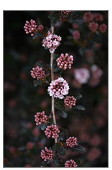
Little Devil Ninebark flowers