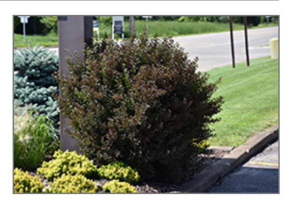
Little Devil Ninebark