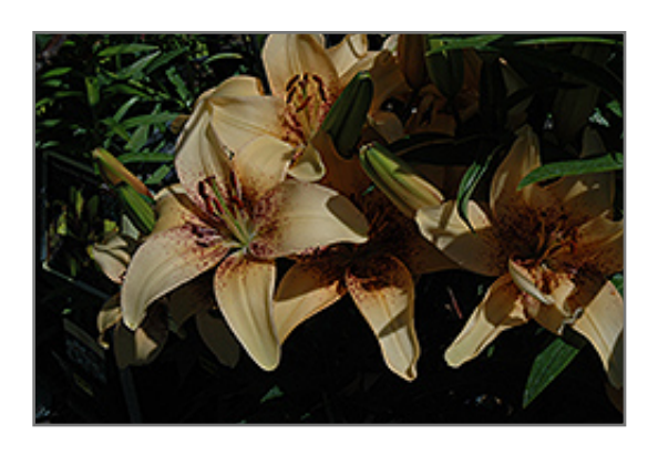
Tango Passion 4-You Lily flowers