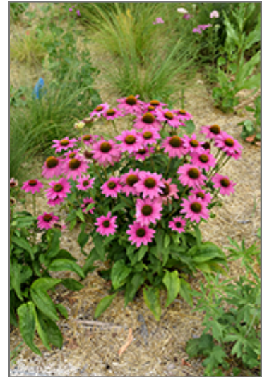
PowWow Wild Berry Coneflower in bloom

PowWow Wild Berry Coneflower is recommended for the following landscape applications;