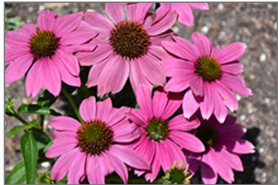
PowWow Wild Berry Coneflower flowers