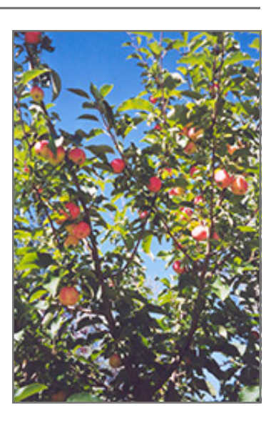
September Ruby Apple fruit

Aside from its primary use as an edible, September Ruby Apple is sutiable for the following landscape applications;