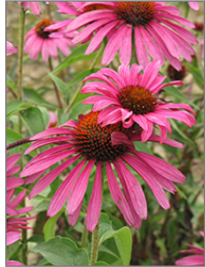
Ruby Star Coneflower flowers