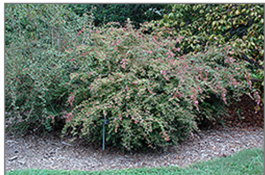
Edward Goucher Abelia in bloom