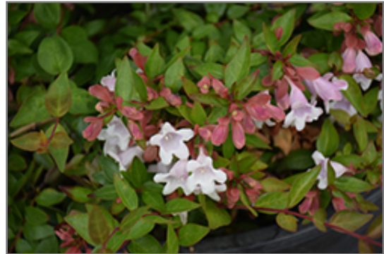
Edward Goucher Abelia flowers

Edward Goucher Abelia is recommended for the following landscape applications;