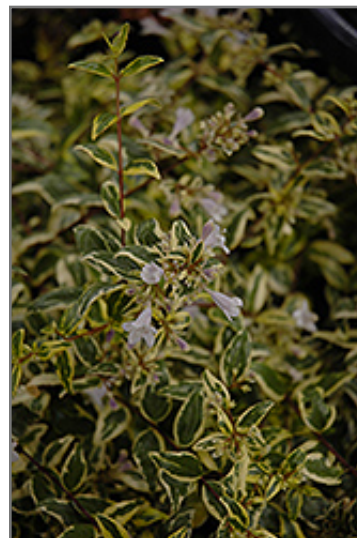
Twist of Lime Glossy Abelia flowers

This plant is not reliably hardy in our region, and certain restrictions may apply; contact the store for more information.