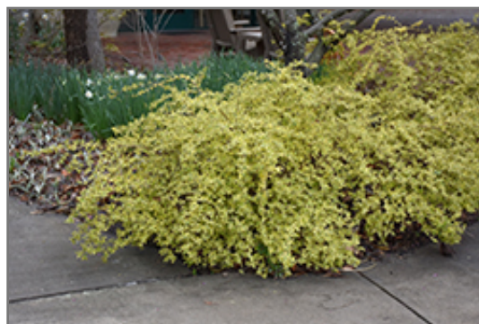
Twist of Lime Glossy Abelia

Twist of Lime Glossy Abelia is recommended for the following landscape applications;