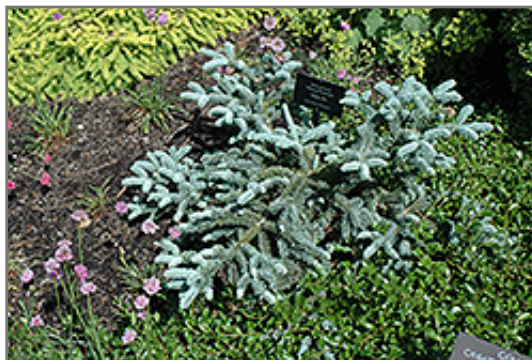
Prostrate Blue Noble Fir

Prostrate Blue Noble Fir will grow to be about 18 inches tall at maturity, with a spread of 6 feet. It tends to fill out right to the ground and therefore doesn't necessarily require facer plants in front. It grows at a slow rate, and under ideal conditions can be expected to live for 70 years or more.