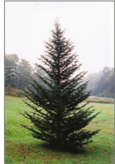
Fraser Fir

Fraser Fir will grow to be about 35 feet tall at maturity, with a spread of 20 feet. It has a low canopy, and should not be planted underneath power lines. It grows at a slow rate, and under ideal conditions can be expected to live for 70 years or more.