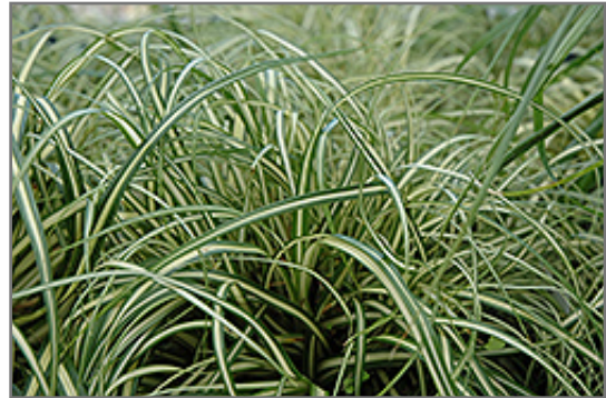
Evergold Variegated Japanese Sedge foliage

Evergold Variegated Japanese Sedge is recommended for the following landscape applications;