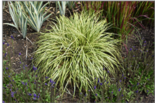
Evergold Variegated Japanese Sedge foliage

Evergold Variegated Japanese Sedge will grow to be about 8 inches tall at maturity, with a spread of 12 inches. Its foliage tends to remain low and dense right to the ground. It grows at a medium rate, and under ideal conditions can be expected to live for approximately 10 years. As an evergreen perennial, this plant will typically keep its form and foliage year-round.